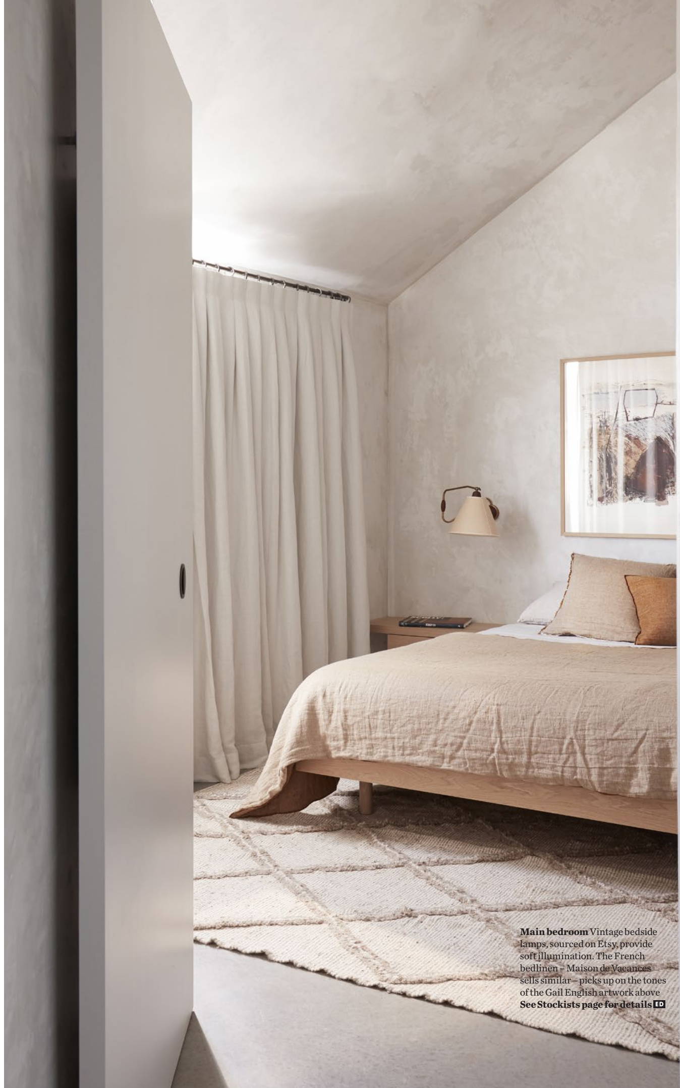
Main bedroom Vintage bedside lamps, sourced on Etsy, provide soft illumination. The French bedlinen – Maison de Vacances sells similar – picks up on the tones of the Gail English artwork above See Stockists page for details