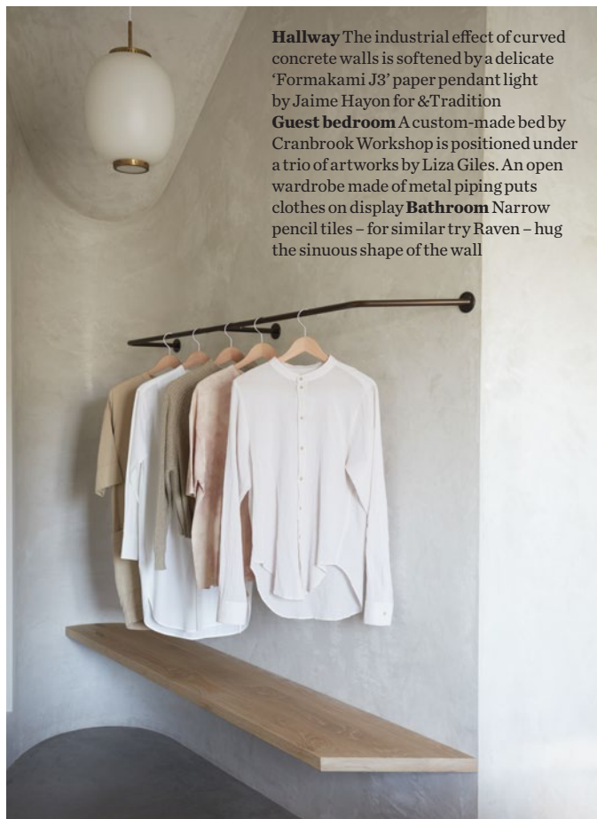
Hallway The industrial effect of curved concrete walls is softened by a delicate 'Formakami J3' paper pendant light by Jaime Hayon for &Tradition Guest bedroom A custom-made bed by Cranbrook Workshop is positioned under a trio of artworks by Liza Giles. An open wardrobe made of metal piping puts clothes on display Bathroom Narrow pencil tiles – for similar try Raven – hug the sinuous shape of the wall